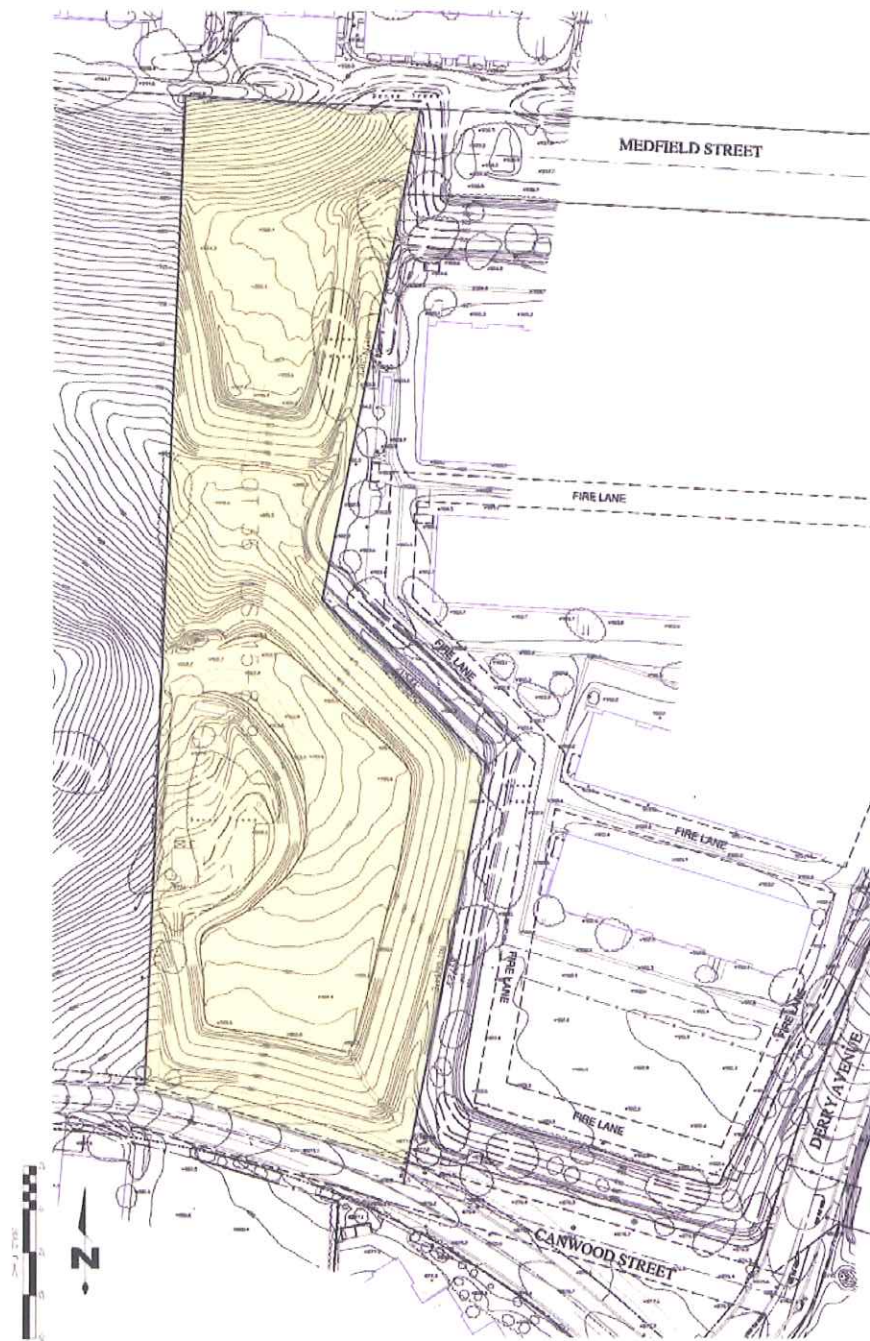
Topographic Map (Contours Every Five Feet)