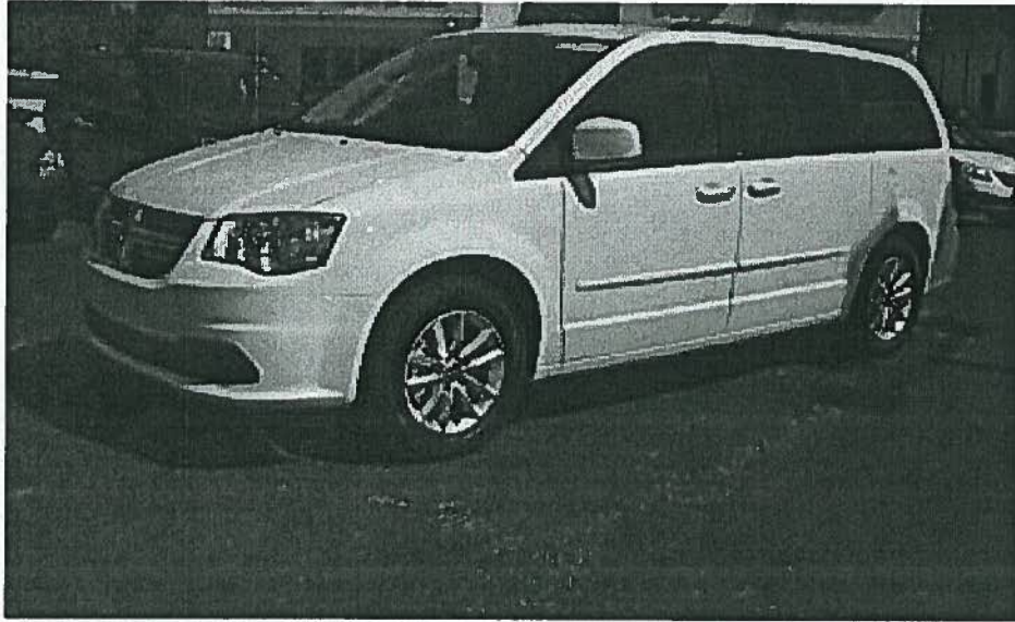
Dodge 2014 Grand Caravan