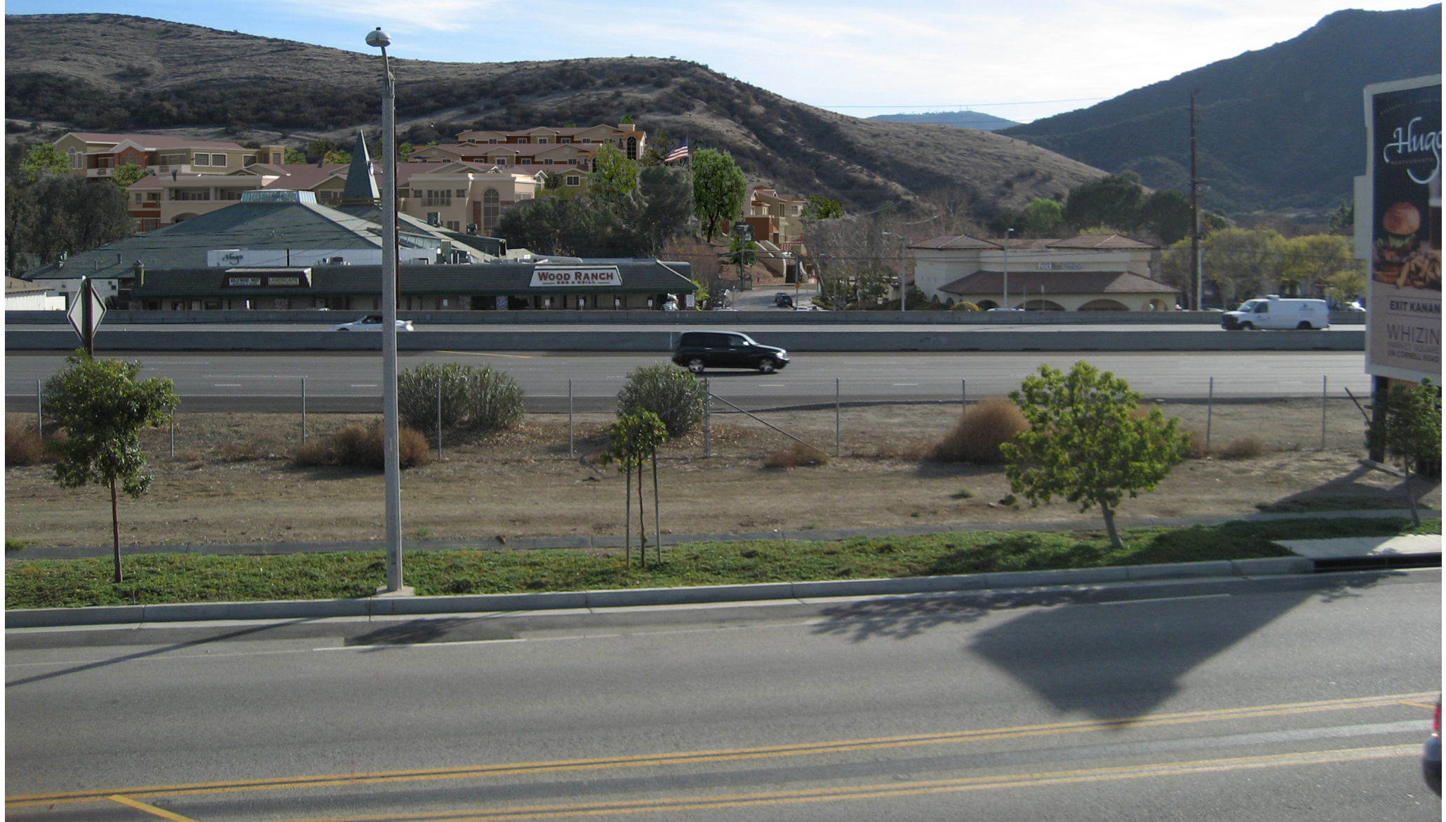
View from US. 101