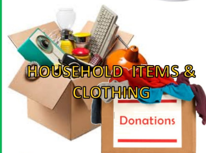
HOUSEHOLD ITEMS & CLOTHING