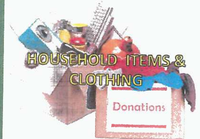
HOUSEHOLD ITEMS & CLOTHING