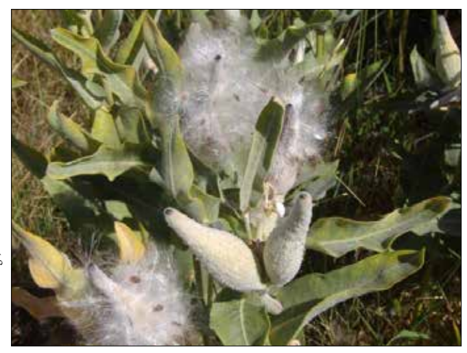
<u>Showy milkweed (Asclepias speciosa)</u>: This species' fruits have a woolly texture and sometimes have warty projections.