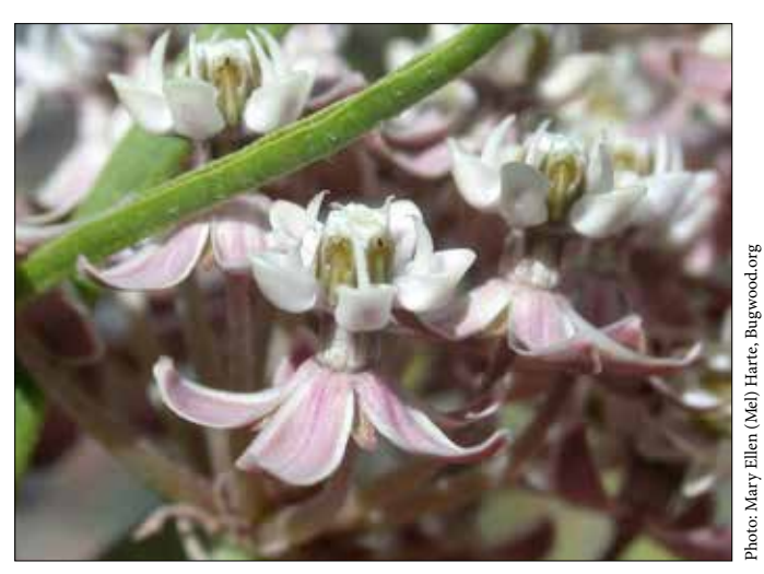
<u>Narrow-leaved milkweed (Asclepias fascicularis)</u>: The corona is white and the corolla is pink.

Milkweeds are named for their milky, latex sap, which oozes from the stems and leaves when plants are injured. Milkweeds are not the only plants that have milky sap, but in combination with the unique flower shape, this can help to positively identify a milkweed plant. To check for the sap, tear off a small piece of leaf to see if it oozes from the torn area. Avoid any contact of the sap with your skin, eyes, or mouth.