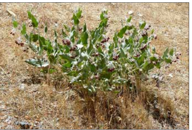
o: © 2011 Jean Pawlek