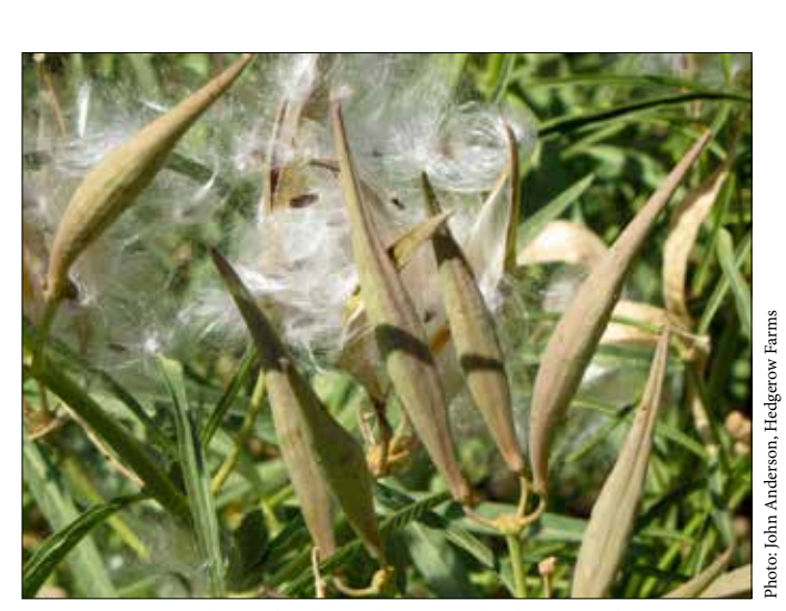
<u>Narrow-leaved milkweed (Asclepias fascicularis)</u>: This species' fruits are hairless and have an elongated, tapered shape.