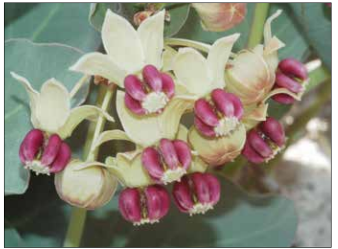
<u>Pallid milkweed (Asclepias cryptoceras ssp. cryptoceras)</u>: The corona is purple and the corolla is pale green.

Milkweed flowers are arranged in clusters. Depending on the species, the stalk that bears the flowers can be either erect or drooping. The showy, upper part of each flower, called the corona , consists of five hoods, where nectar is stored. The shape of the hoods is variable between species. Five petals, which together are called a corolla , form the lower part of the flower and in most species, are bent backwards.