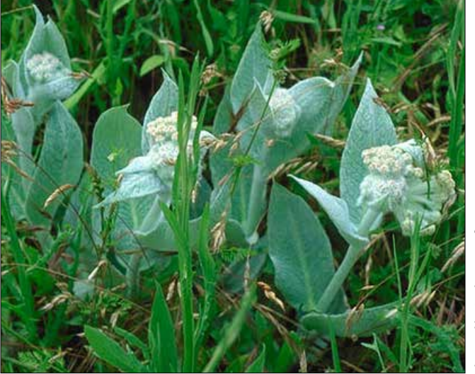
sobby Gendron, Butterfly Encounte