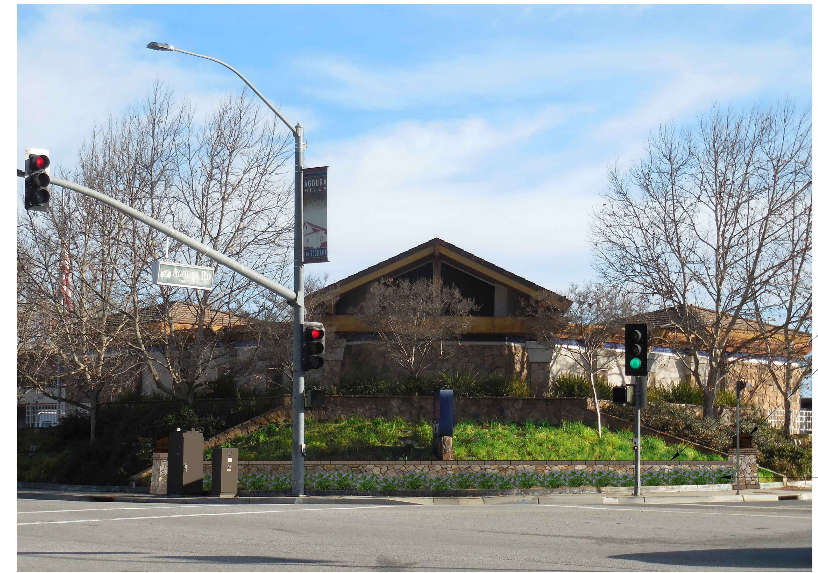
NORTHEAST CORNER RENDERING