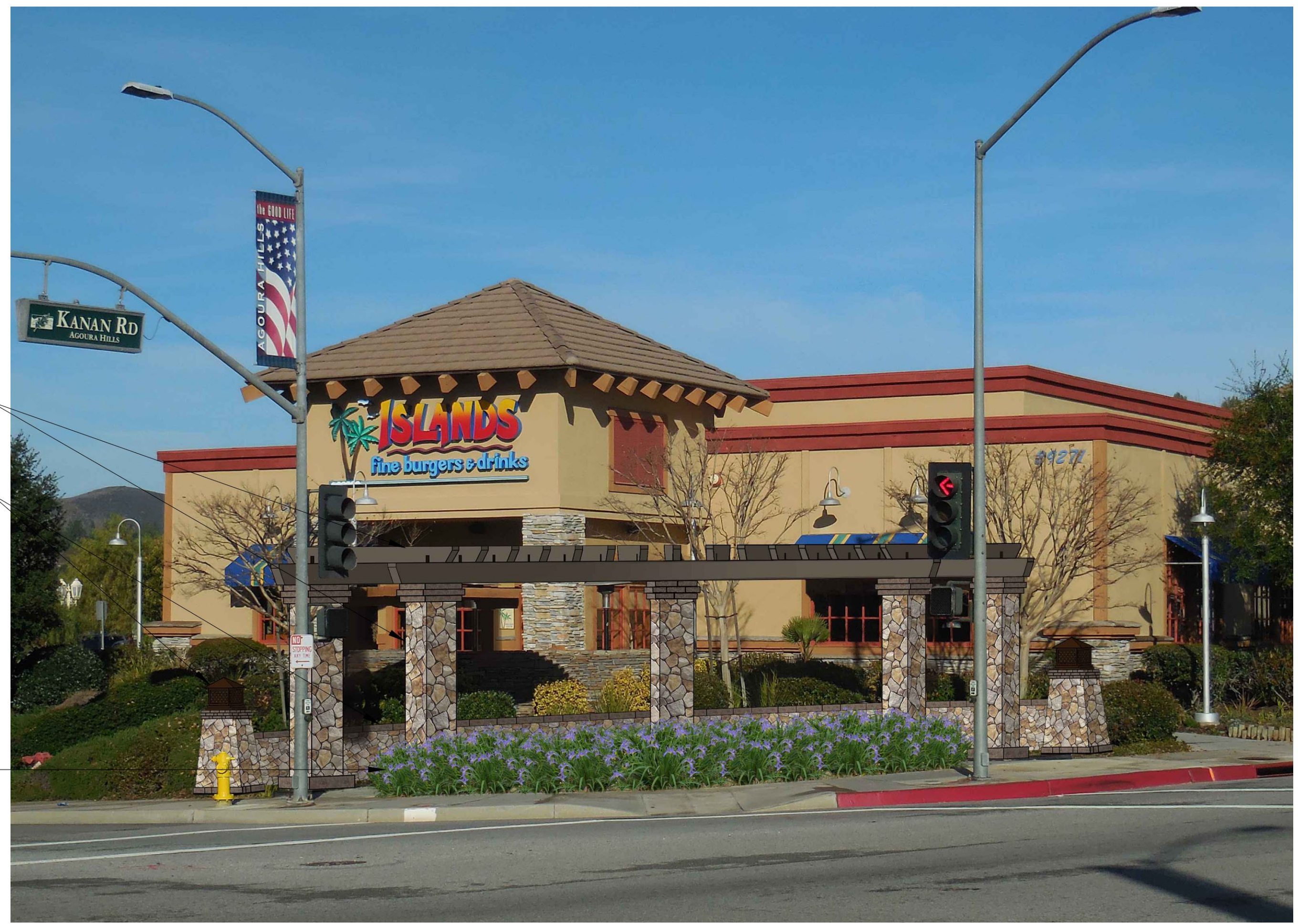
NORTHWEST CORNER RENDERING