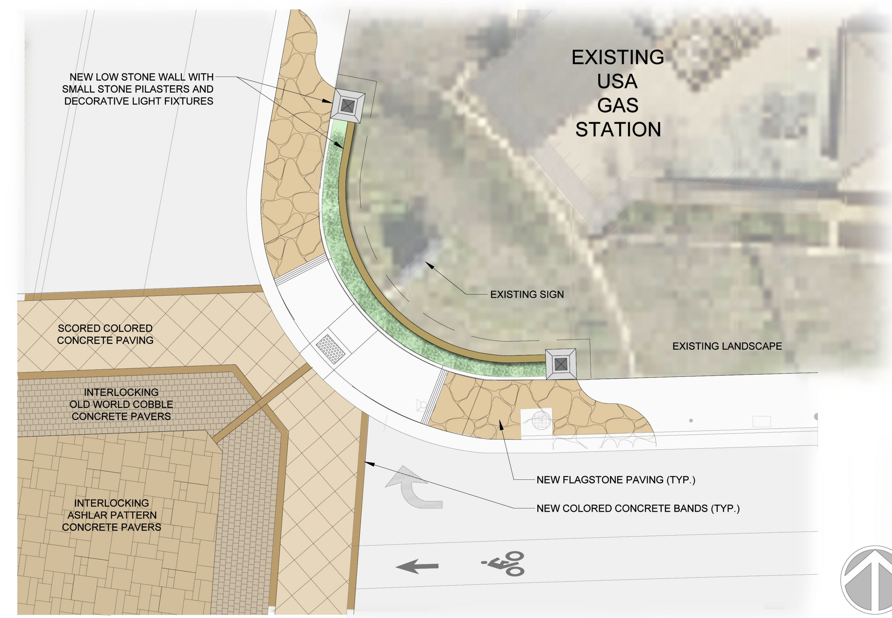
NORTHEAST CORNER PLAN SCALE : 1/8" = 1'-0"