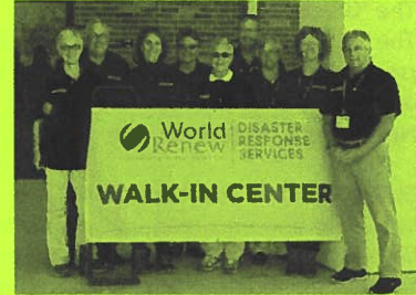
World Renew y sus voluntarios de "camisetas verdes" ayudan a comunidades por todo el mundo a desarrollar su capacidad para prepararse y recuperarse de un desastre.

¡Cualquier persona afectada por el incendio de Woolsey debería participar, sin importar su estado migratorio!