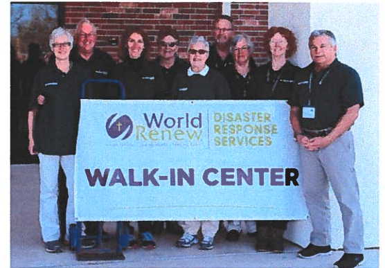
World Renew and their "Green Shirt" volunteers help communities around the world build their capacity to prepare for and recover from disaster.

ANYONE AFFECTED BY THE WOOLSEY FIRE DISASTER SHOULD PARTICIPATE!!!