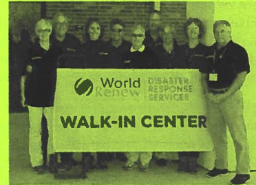
World Renew and their "Green Shirt" volunteers help communities around the world build their capacity to prepare for and recover from disaster.