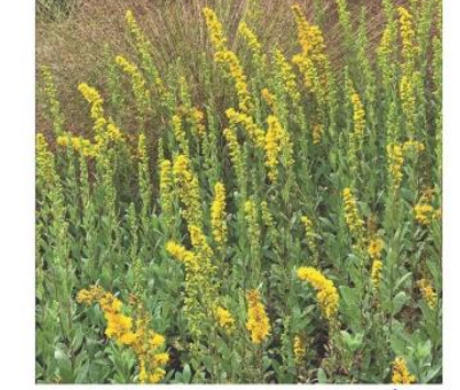
Solidago velutina ssp californica "California Goldenrod"