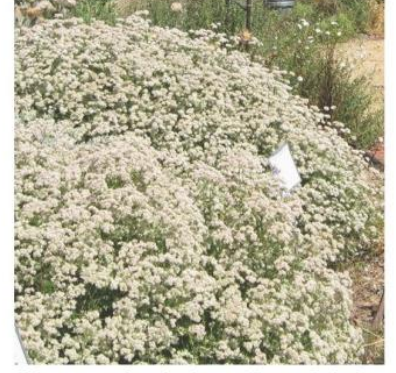
Eriogonum fasciculatum 'Dana Point' "Dana Point Buckwheat"