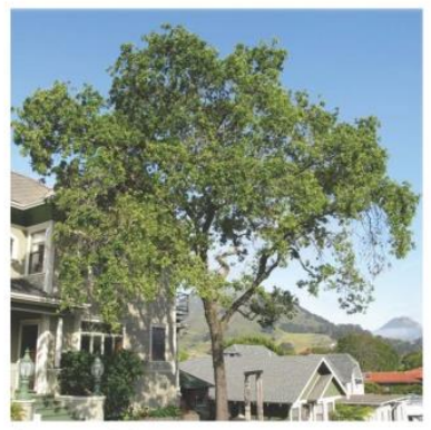
Quercus lobata "Valley Oak"