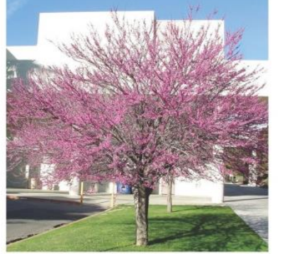
Cercis occidentalis "Western Redbud"