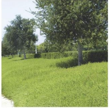
Baccharis pilularis 'Pigeon Point' "Dwarf Coyote Brush"