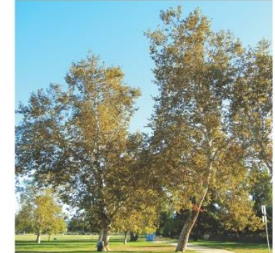
Platanus racemosa "Western Sycamore"