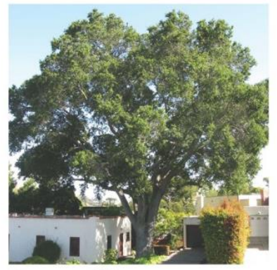
Quercus agrifolia "Coast Live Oak"