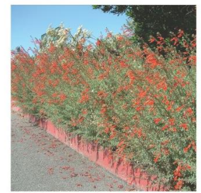
Epilobium canum 'Catalina' "Catalina Fuchsia"