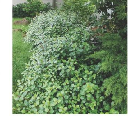
Ribes viburnifolium "Catalina Currant"