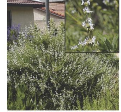
Salvia mellifera "Black Sage"