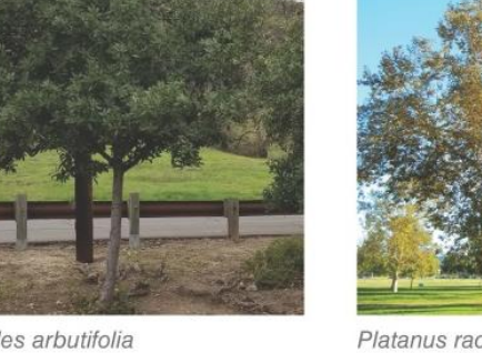
Heteromeles arbutifolia "Toyon"