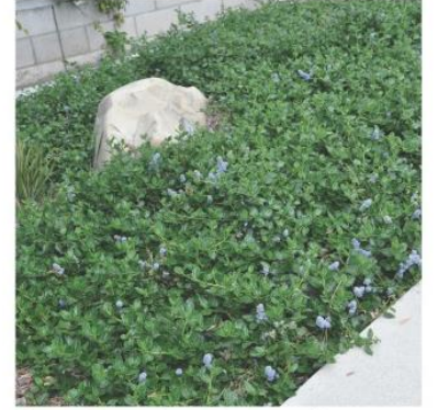
Ceanothus griseus horizontalis 'Yankee Point' "Yanke Point California Lilac"