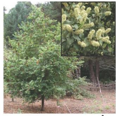
Prunus illicifolia "Hollyleaf Cherry"