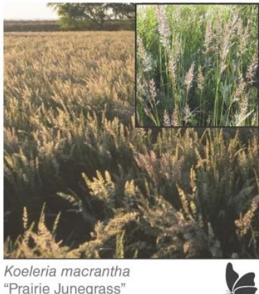
Koeleria macrantha "Prairie Junegrass"