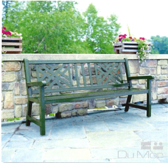
EXHIBIT 1 – Amenity Photos