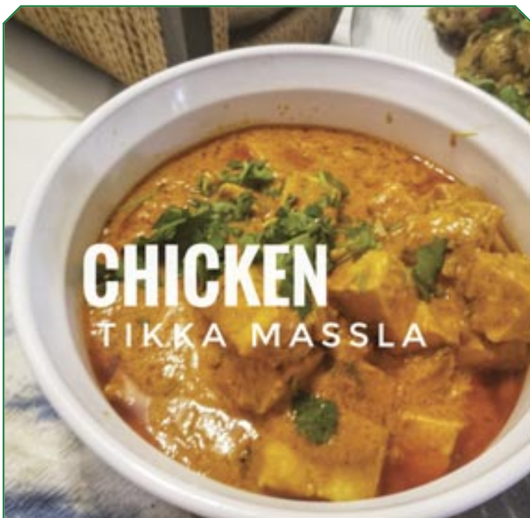
CHICKEN TIKKA MASSALA

*To enroll, please call the Recreation Center at (818) 597-7361.