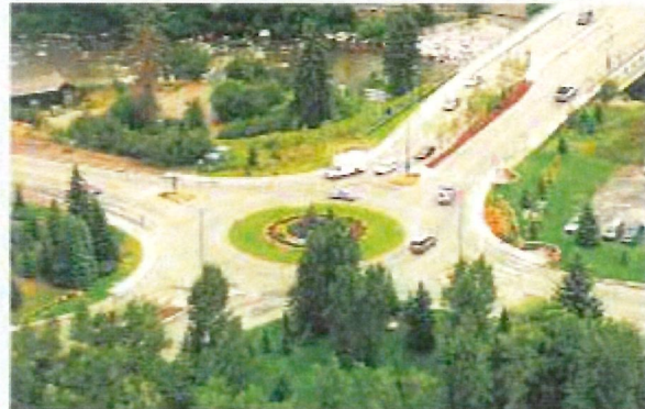
Roundabouts provide a better traffic flow, calm traffic, and provide a visual interest to the area