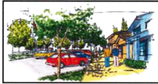
Pedestrian-oriented buildings and sidewalks welcome people to walk within the Village