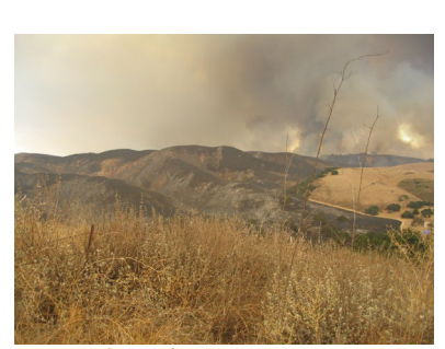
Smoke from fires can be a major contributor to point source pollution