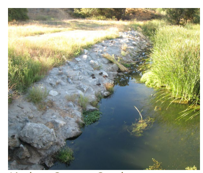
Lindero Canyon Creek

Policies in this section guide development and infrastructure practices to support water conservation and protect surface water and groundwater from the degradation of runoff and pollution. Agoura Hills has a number of blue-line streams that intermittently transport water. The four primary creeks are Medea, Lindero Canyon, Chesebro, and Palo Comado. Medea Creek flows through the center of Agoura Hills, encompassing unimproved and improved channels and an open space corridor. Lindero Canyon Creek runs through the canyon in the northwest quadrant of the City to empty into Lake Lindero then daylights again just south of Agoura Road west of Kanan Road. Palo Comado Creek crosses the northeast section of Agoura Hills. Chesebro Creek in the City runs along the north side of Agoura Road between Lewis Road and Medea Creek. In addition to these watercourses, a number of streams throughout Agoura Hills intermittently transport water.