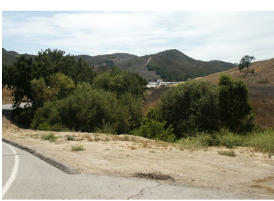
Wildlife corridor located within Liberty Canyon