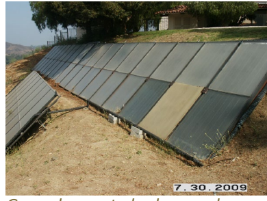
Ground-mounted solar panels

Energy use contributes significantly to emissions of air pollutants as well as greenhouse gases that contribute to global warming. Energy conservation provides one of the major avenues of achieving clean air through a reduction of the emissions that contribute to pollution and increase global warming. Important to the community's goals for environmental sustainability, efforts to conserve energy further energy independence and the availability of natural resources for future generations.