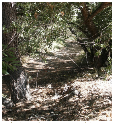
Palo Comado Canyon Creek is a natural waterway in the community