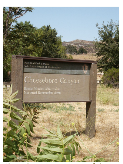
Monica Mountains National Recreation Area, has over 2,000 acres of rolling oak woodland

Some of the larger open space parcels located within Agoura Hills and the Cheeseboro Canyon, part of the Santa adjoining planning area are designated as restricted open space. This category includes areas in which development rights are assumed to exist, but where development potential is constrained because of natural habitat, visual and aesthetic value, and ownership by land conservation groups. Some dwelling units are allowed within restricted open space areas limited to densities of no greater than one unit per 5 acres. Other areas, such as Morrison Highlands, contain restricted open space/deed-restricted lands that are held by homeowners associations. Figure NR-1 (Open Space Resources) identifies open space resource areas within and surrounding the City of Agoura Hills and includes a wildlife corridor, City parks, school playgrounds, the Santa Monica Mountains National Recreational Area. Other open space areas identified on this map include private lands, such as those owned by homeowners associations (Morrison Ranch) or private development sites (Ladyface Mountain Specific Plan, and publicly ownedpreserved open space (Agoura Village). Within the community, several open space corridors provide access for people and wildlife to passive and active open