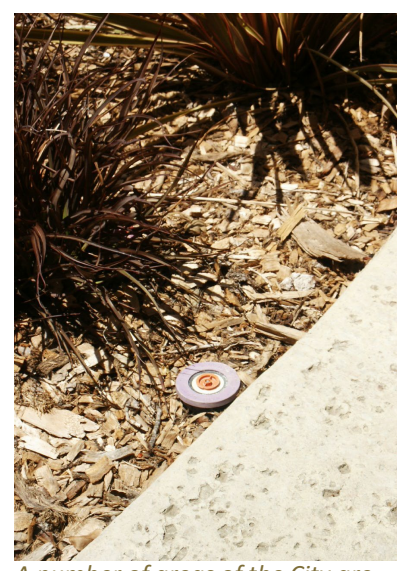
A number of areas of the City are irrigated with reclaimed water