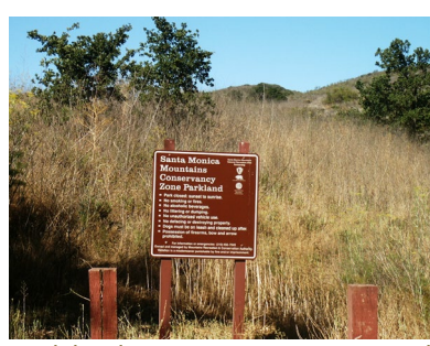
Park land preserve on Agoura Road

Open Space System. Preservation of open space to sustain natural ecosystems and visual resources that contribute to the quality of life and character of Agoura Hills.