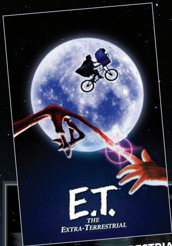
E.T. THE EXTRA-TERRESTRIAL June 11, 2022