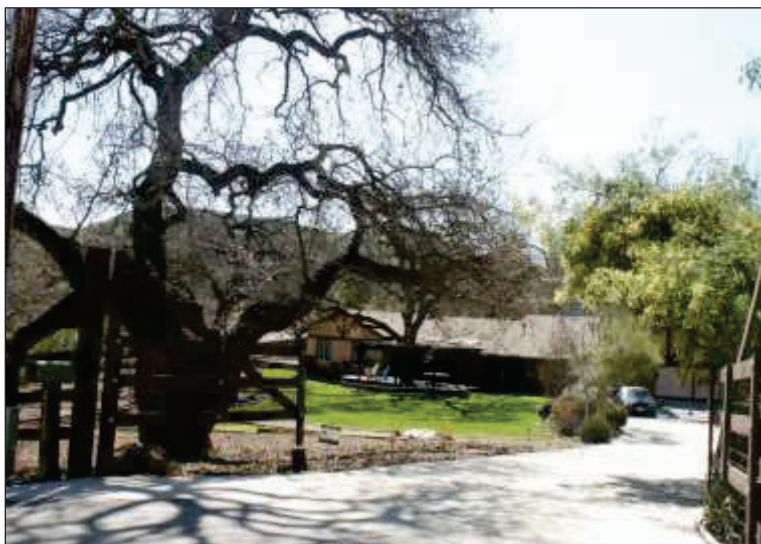
Old Agoura District