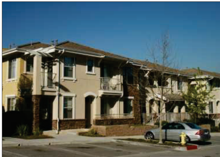
Oak Creek Apartments

A vacancy rate of five percent for rental housing and two percent for ownership housing is generally considered healthy and suggests that there is a balance between the supply and demand of housing. As measured by the 2014-2018 American Community Survey, the residential vacancy rate in Agoura Hills was 0.5 percent for ownership units, indicating a high pent-up demand for ownership housing in the City. Meanwhile, the rental vacancy rate was shown at 4.8 percent, indicating sufficient supply to meet rental demands.