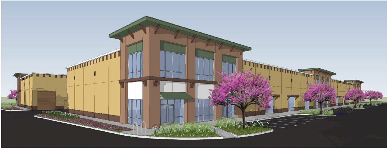
PERSPECTIVE BUILDING 'D' - SOUTHWEST VIEW