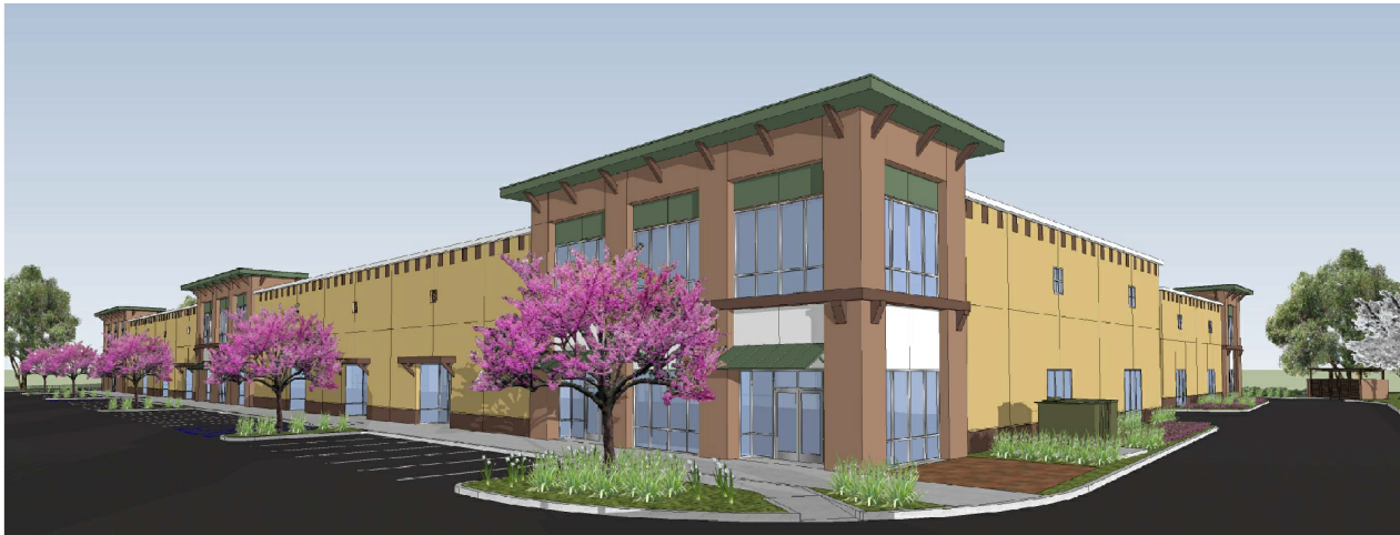
PERSPECTIVE BUILDING 'D' - SOUTHEAST VIEW

AGOURA BUSINESS CENTER NORTH PHASE II 28121 CANWOOD STREET AGOURA HILLS, CA.