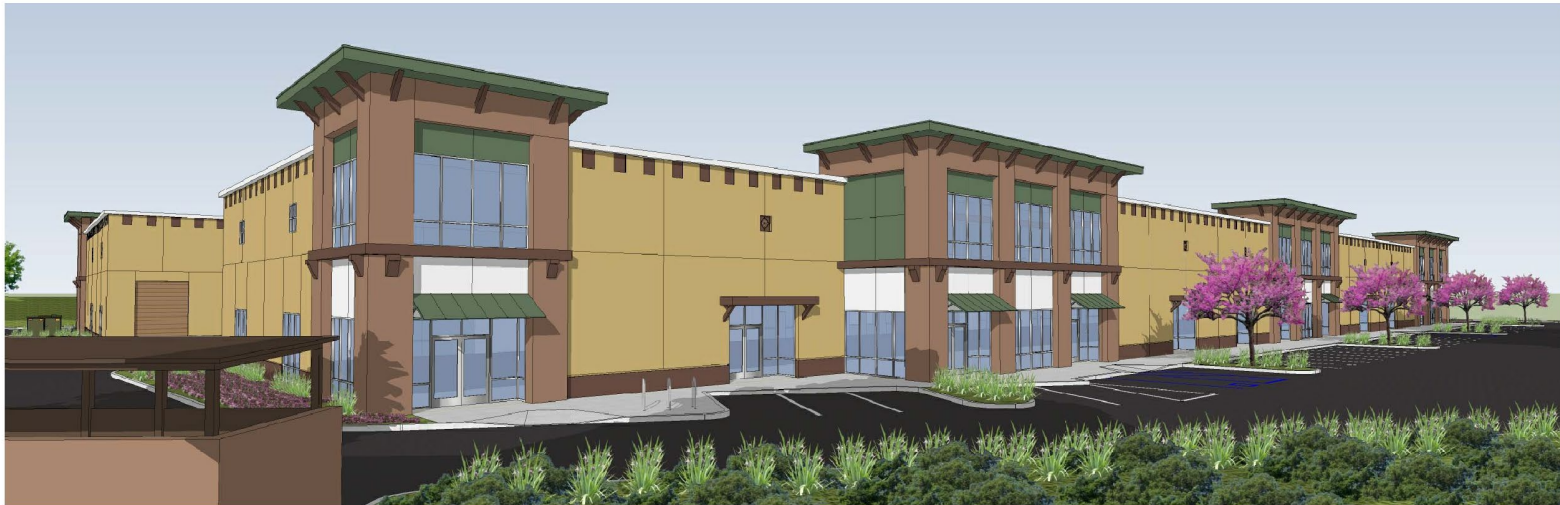
PERSPECTIVE BUILDING 'C' - NORTHEAST VIEW