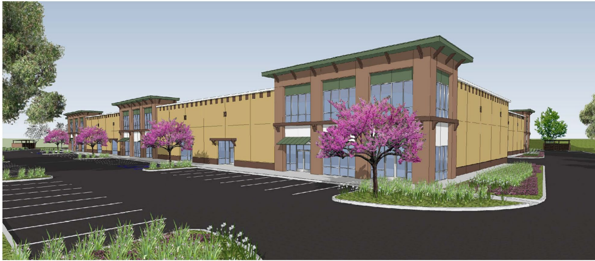
PERSPECTIVE BUILDING 'C' - NORTHWEST VIEW