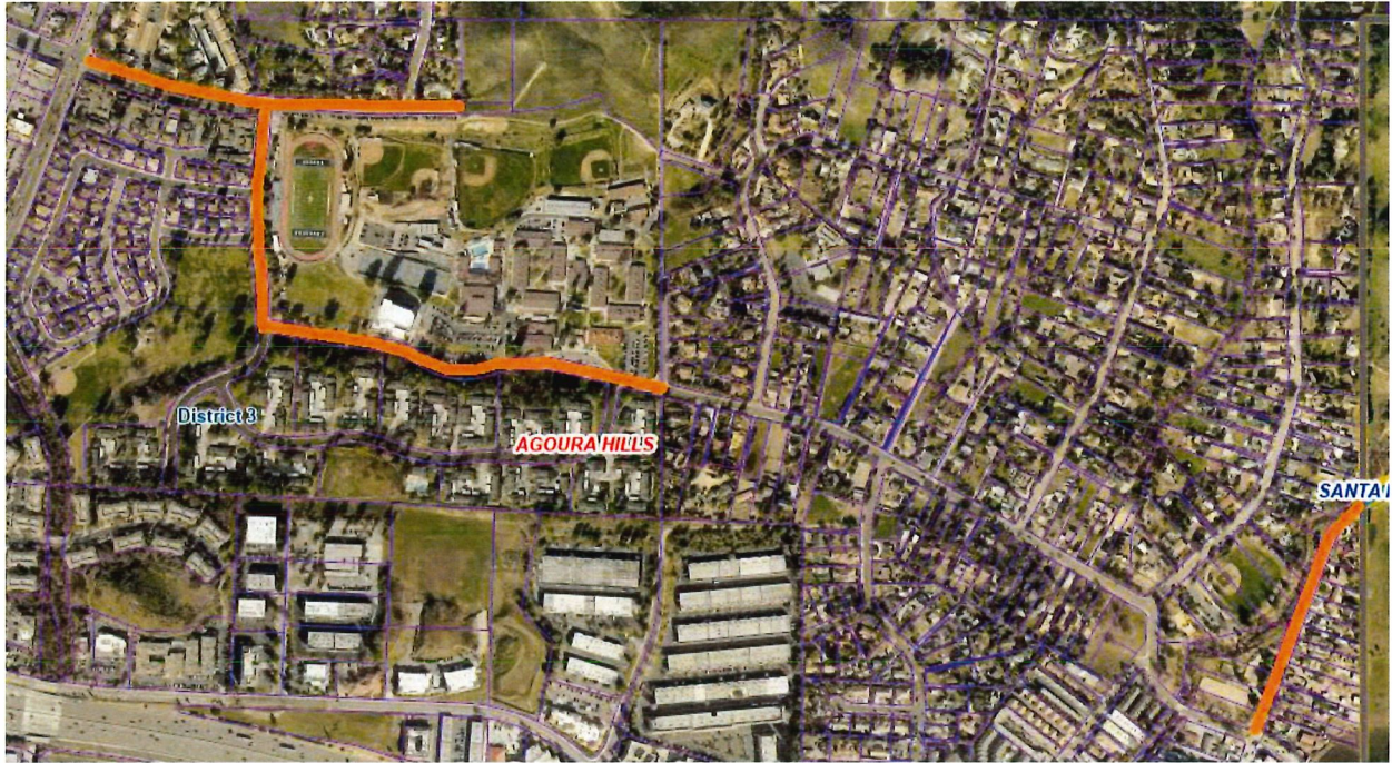
Thousand Oaks Blvd, Argos Street, Driver Avenue, and Chesebro Road