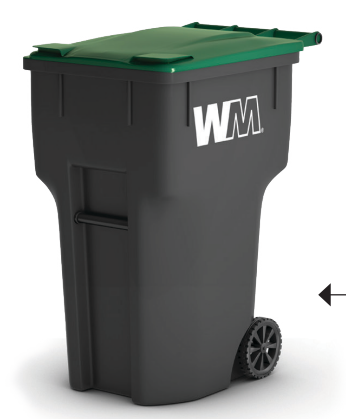
DO NOT INCLUDE: LOOSE PLASTIC BAGS SERVEWARE/UTENSILS PLASTIC CONTAINERS FOAM CONTAINERS HAZARDOUS WASTE