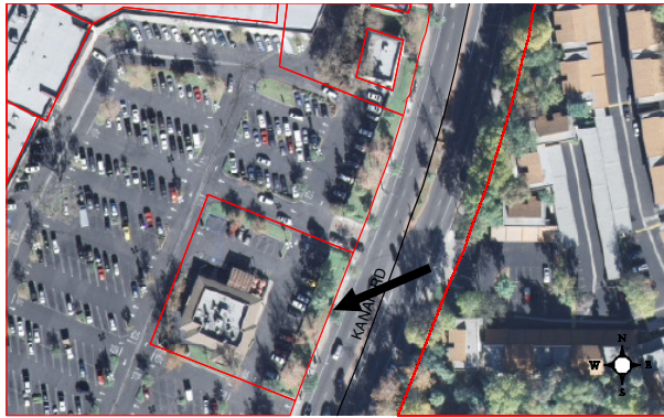
5700 Block – Kanan Road