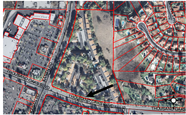
28900 Block of Thousand Oaks Blvd