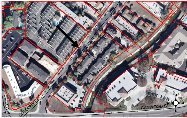
5200 Block - Colodny Dr