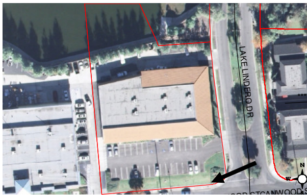
30600 Block of Canwood