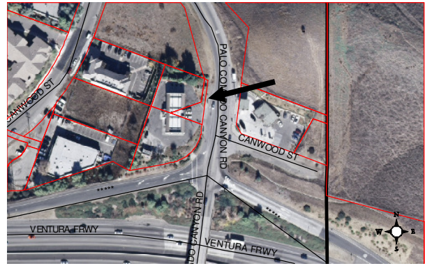
5200 Block – Palo Camado