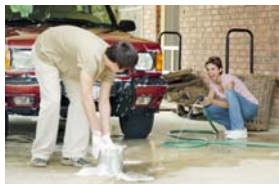
Wash your car on the grass, this also waters the lawn

Pollutants from vehicle cleaning including heavy metals (copper, lead, nickel and zinc), hydrocarbons (oil and grease), toxic chemicals (solvents,