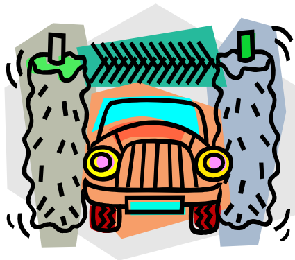
Most carwashes recycle the water. Saving hundred of gallons of water each day.