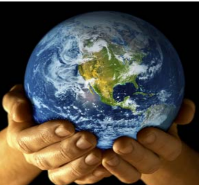
Be kind to our home, our children are counting on us

These guidelines apply even if the cleaning products are labeled “nontoxic” or “biodegradable”. Although these products may be less harmful to the environment, they can still have harmful effects if they enter into storm drain untreated.