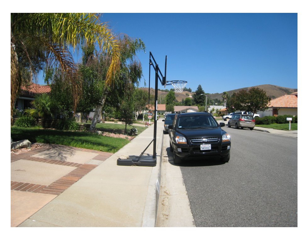
Stanchion blocking sidewalk