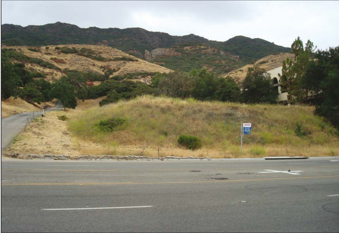
Photo 1 - View of project site looking south.