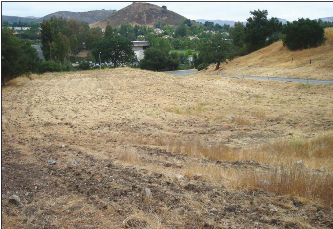
Photo 2 - View of the project site looking north.