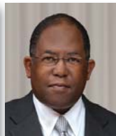
Mark Ridley-Thomas 2nd District