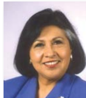
Gloria Molina 1st District

Now it's time for all of us to come together, carry out and realize what's contained in the "four corners" of this plan. To do so, we need champions to help implement the plan; and, there are roles for everyone in the public, private and non-profit sectors to play. We invite local residents and the best and brightest leaders from the most creative firms from around the world to participate and help us reach our goals.